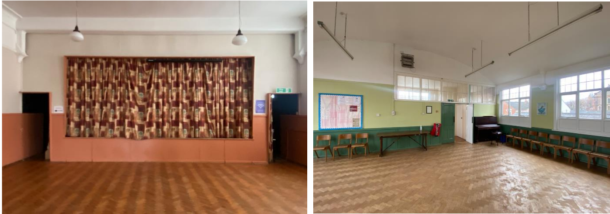
Figure 3: Main stage, ground floor, and upstairs classroom

The first floor has two large high ceilinged open plan rooms, with several smaller rooms around it. The original layout is largely intact with some areas of modernisation. There are typical finishes of the period, largely unaltered but in need of refreshment.