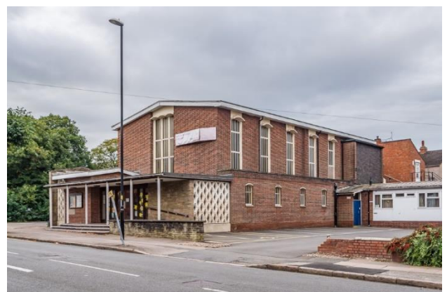
Figure 3: Modern day Hearsall Baptist Church https://www.geograph.org.uk/photo/7003652

It should be noted that the modern day Hearsall Baptist Church is not part of this assessment and is therefore not individually assessed. It is within the existing site, to the south of Former Hearsall Baptist church and connects to the former Church by a corridor to at the rear of the car park. The modern day Hearsall Baptist Church (built 1962) can be seen in figure 3.