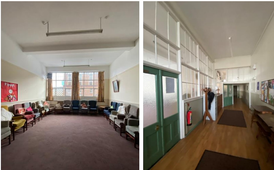
Figure 4: Ground floor sitting room and corridor behind.