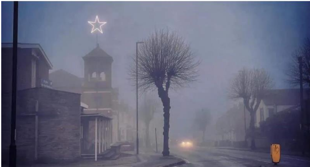
Figure 4: Photograph; Kirsty Brewton. BBC Article: Petition to protect Coventry Church Dec. 22, 2023

understood to hold local favour, and a recent local petition was created seeking to protect it.